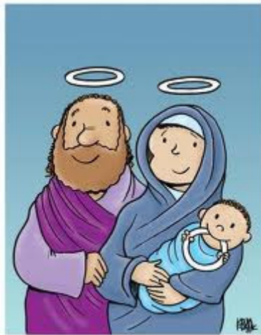
THE BABY JESUS STARTS TEETHING.